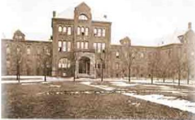
Cleveland's City Hospital